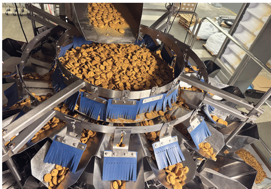
The star of Zoroco's bagging operation is a combination weigher from High Tek.

A large linear oven fed by automated depositors is capable of processing